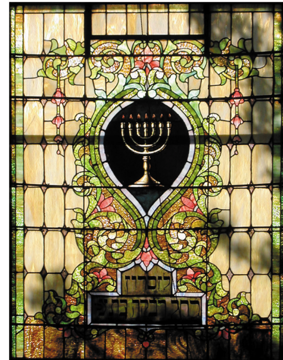
Appearing to be a menorah in the daytime but a kiddush cup at night, the unique stained-glass window on the west side of the synagogue is part of the original building.

We will need major commitments for funding to accomplish our goals. Please give generously to help re-establish Sons of Abraham Synagogue as a dynamic center for religious education, worship, renewal, and social action.